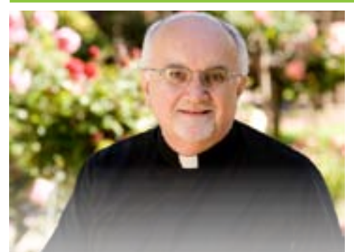
Dear Brother and Sister Salesians:

USA West Province Newsletter • Building Bridges Between Communities