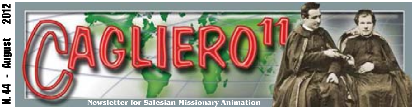
A Publication of the Mission Department for the Salesian Communities and Friends of the Salesian Mission