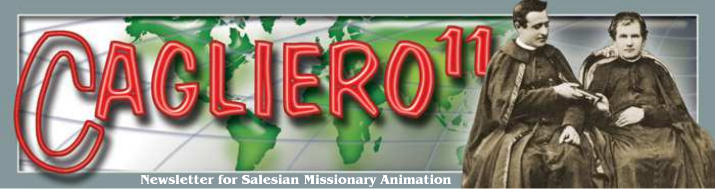
A Publication of the Mission Department for the Salesian Communities and Friends of the Salesian Mission