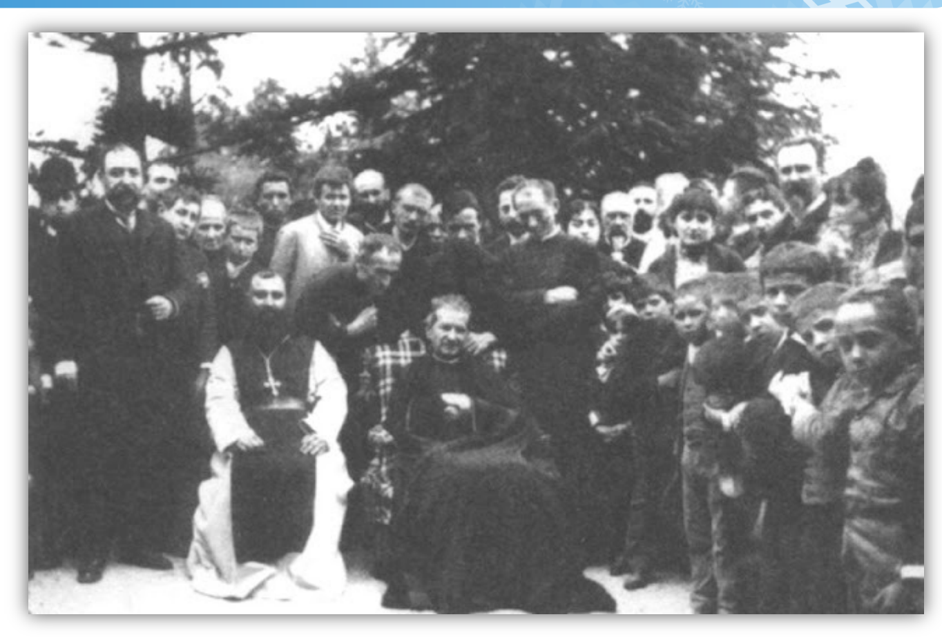
Key Historical Figures