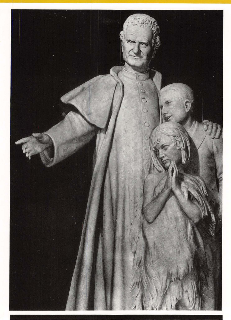
Don Bosco's Statue In St. Peter's, Rome