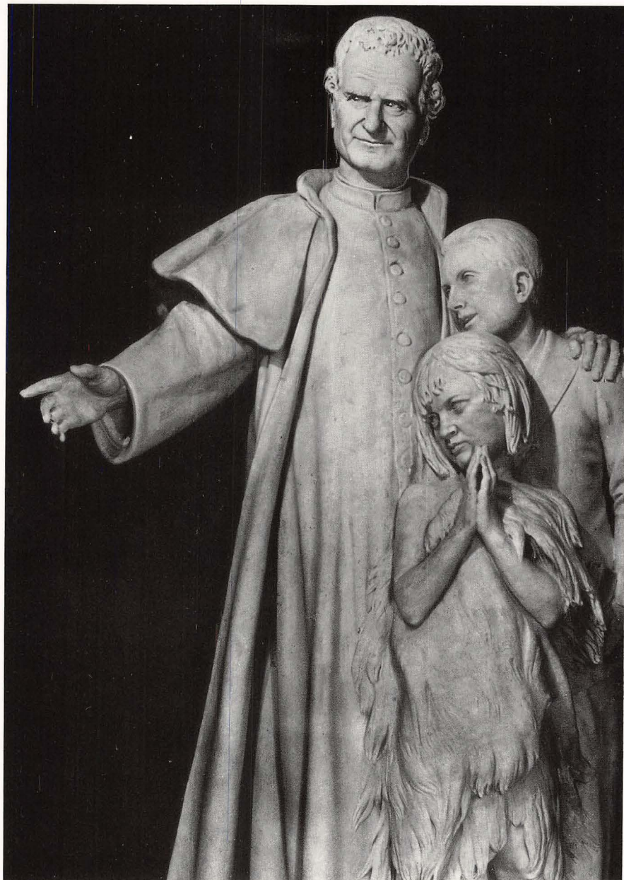
Don Bosco's Statue In St. Peter's, Rome